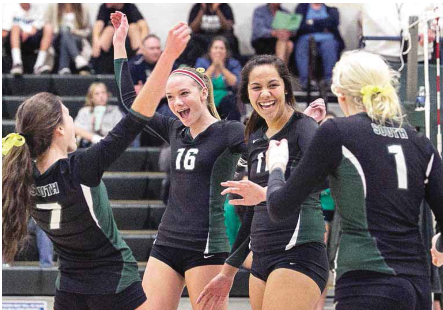
The South High girls' volleyball team had a fantastic three-victory surge last week to qualify for the CIF Semi-Finals for the third year in a row. At the quarter-final, in a packed and spirited Spartan gym, South defeated Rancho Cucamonga 3-0 to earn the right to play #2 Oaks Christian in the semi.