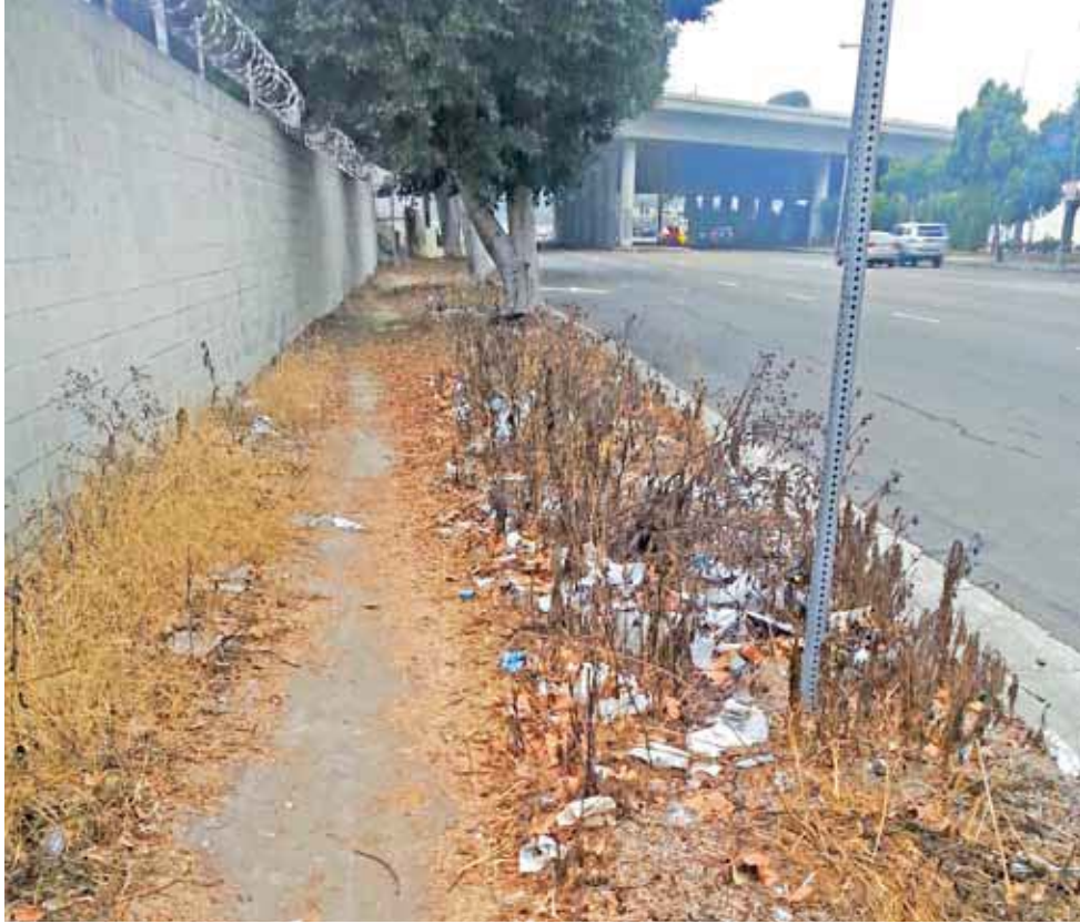
Before Photo: A stretch of 190th Street before the cleanup.

three hours on a Saturday morning whacking weeds, picking up garbage and carting away the waste. If you would like to get involved, go visit www.mattucciproject.org for more information.