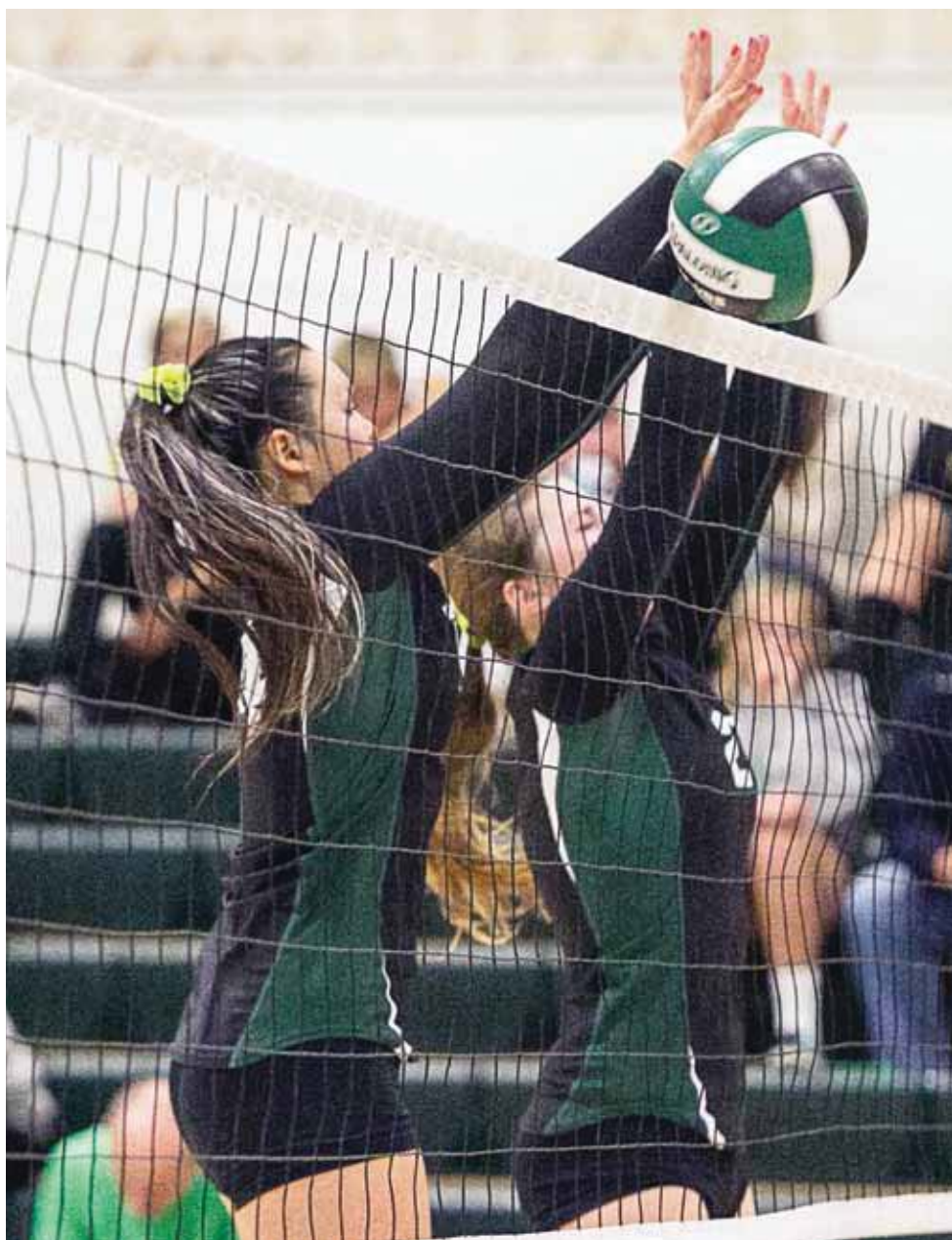
South High Lady Spartans defend the net and qualify for CIF Semi Finals.