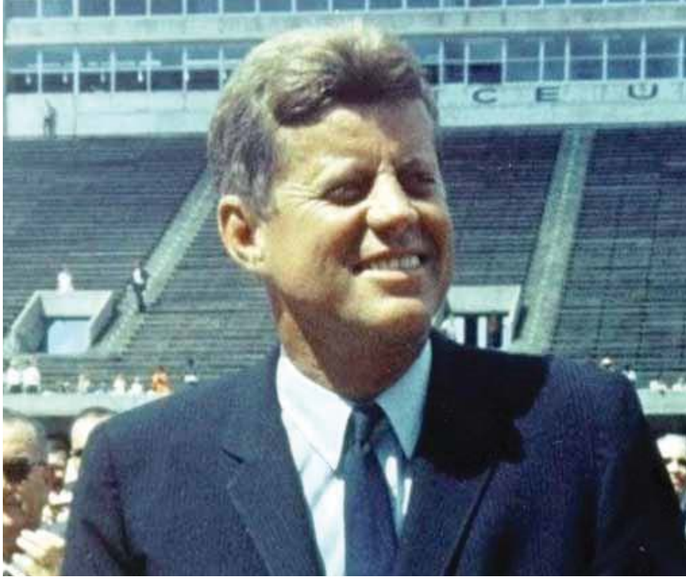
President John F. Kennedy.