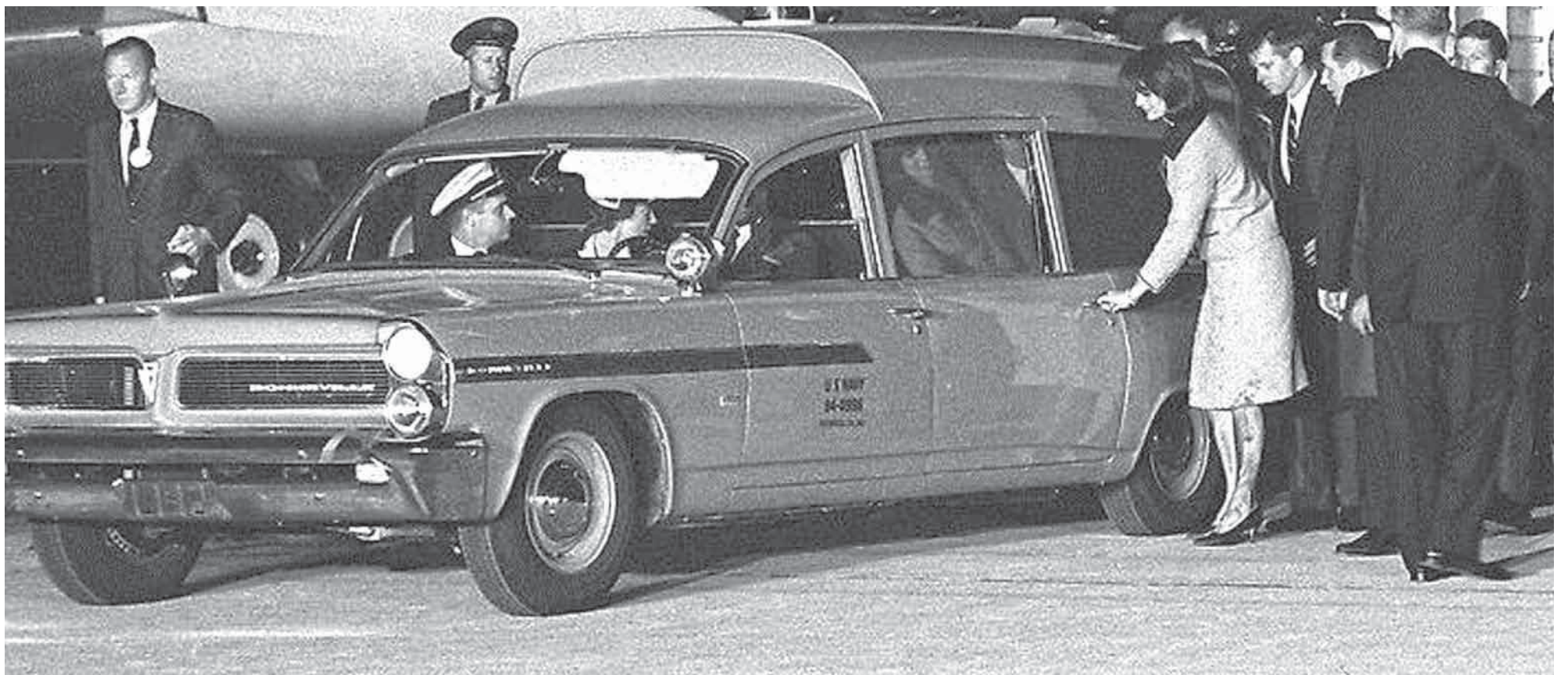
Jacqueline Kennedy reaching for the handle of the ambulance. Notice her bloodstained dress and stockings.