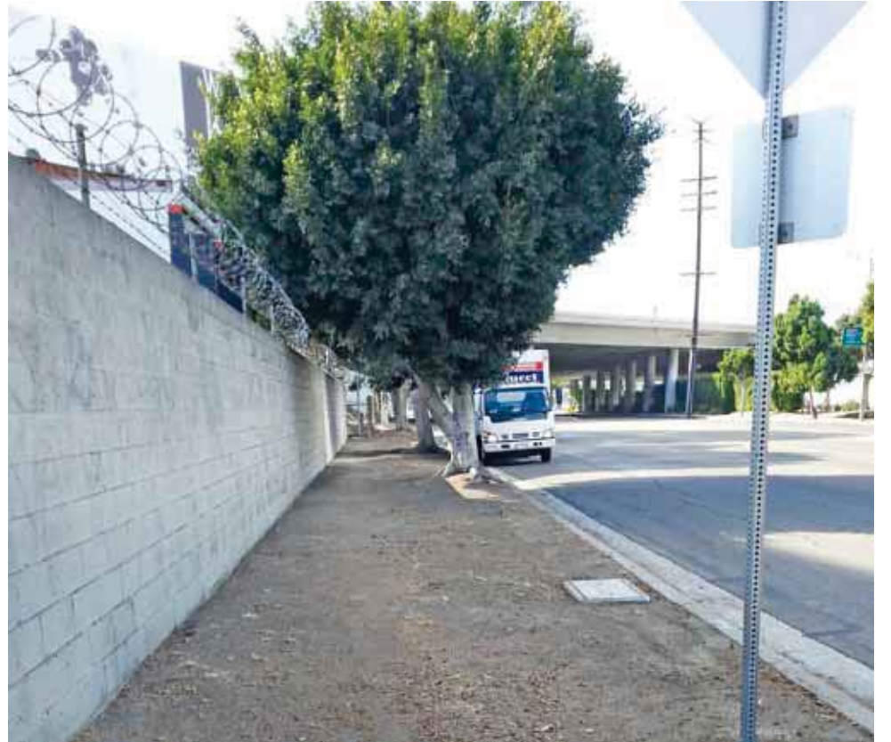
After Photo: A much-needed improvement. Lots better!