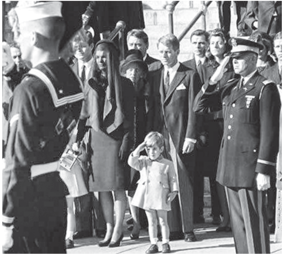
Three-year-old JFK Jr. salutes his slain father.